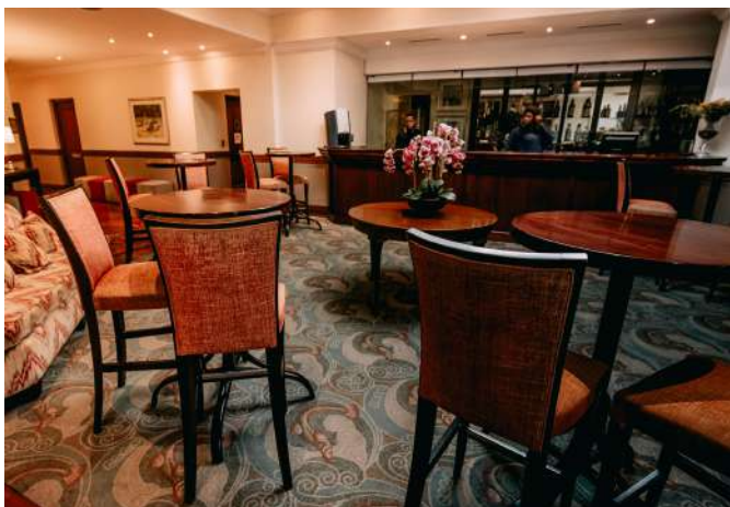
THE CONFERENCE BAR Perfect for after conference drinks or cocktail functions...