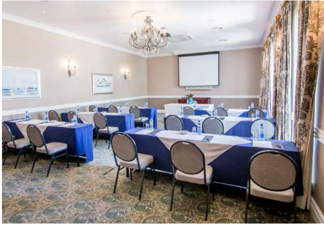
CLASSROOM SET-UP Ideal for large presentations...

ALL CONFERENCING PACKAGES INCLUDE THE USE OF THE VENUE AND THE USE OF STANDARD EQUIPMENT WHICH INCLUDES THE FOLLOWING: