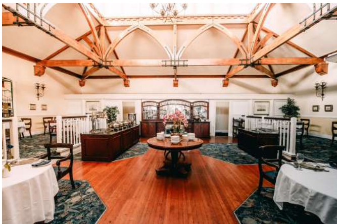
PLATED LUNCH SERVED IN THE CREST RESTAURANT Delectable dishes on offer. Specific requirements can be catered for...