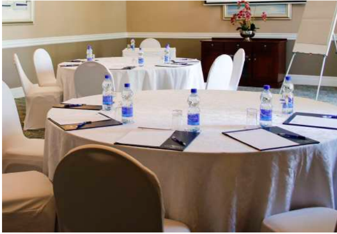
BANQUETING SET-UP Ideal for large product launches...